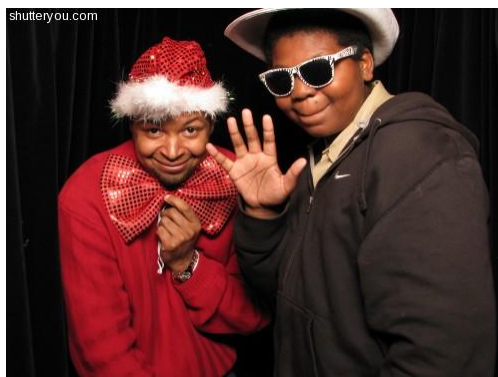
Spartanburg Holiday Party