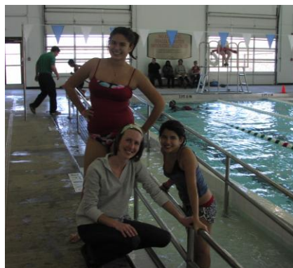
Greenville Holiday Party