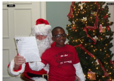
Anderson Holiday Party