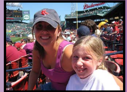
Taking in a Red Sox game at Fenway Park