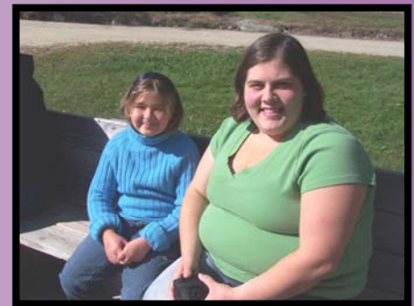
Apple Picking at Demeritt Hill Farm