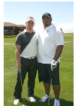
HONORARY CO-CHAIRS James Wisniewski Chicago Blackhawks and Roberto Garza Chicago Bears